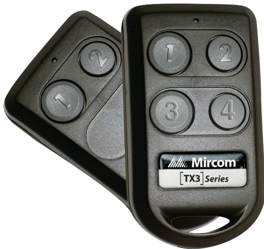
TX3-WRT-2H / TX3-WRT-4H

Mircom's high frequency, long-range identification solution. Wiegand Transmitters and Receivers with integrated receiver antenna.